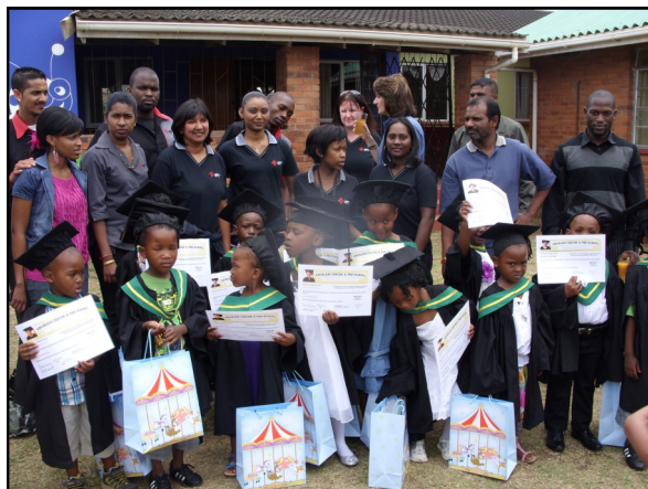
Students of the Ebuhleni Preschool and Creche

After evaluating a number of projects in the Durban area, support has been selected for the Ebuhleni Preschool and Creche. The preschool operates on land donated for educational purpose by a church in Kwa Masu, north of Durban.