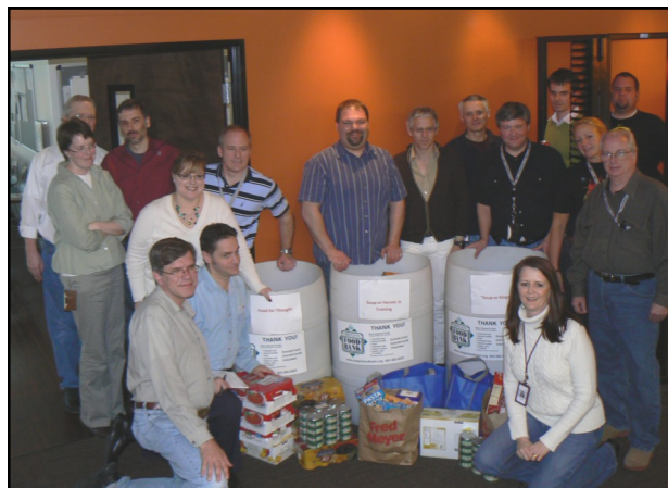
Team members of the UTi Portland Office Food Drive

In all, over 633 pounds of food was collected and donated to the Oregon Food Bank. The office also sponsored two local families in need during Christmas, providing holiday cheer by purchasing every item on the families' wish list. Congratulations to all for your wonderful efforts and teamwork!